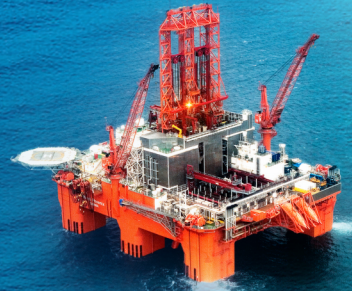
West Phoenix – Front View

The West Phoenix is a 6th generation ultra-deepwater dual activity ram-rig harsh environment semi-submersible with operational history in UK and Norway